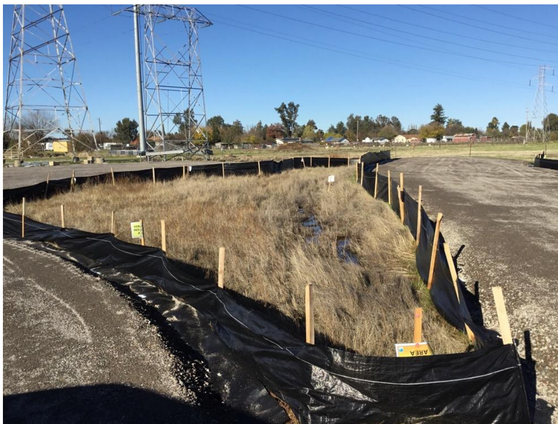
Photo 5: Sensitive environmental resources were clearly marked with signs and silt fencing maintained at Pull Site 0/1B in accordance with the project requirements.