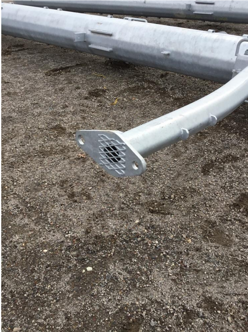
Photo 4: Small openings are covered to prevent wildlife use in accordance with the Project's ITP.