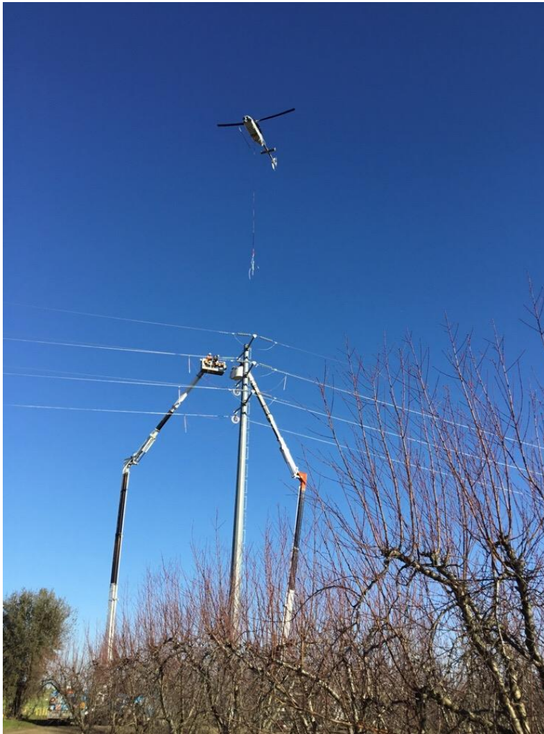
Photo 1: CPUC EM observed crews receiving helicopter delivery of insulators and the installation of insulators at structure 2/24.