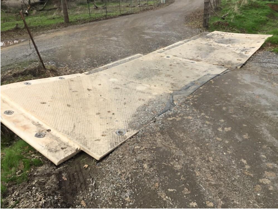
Photo 3: Installation of track-out mats at Landing Zone 4/31 to prevent track-out.